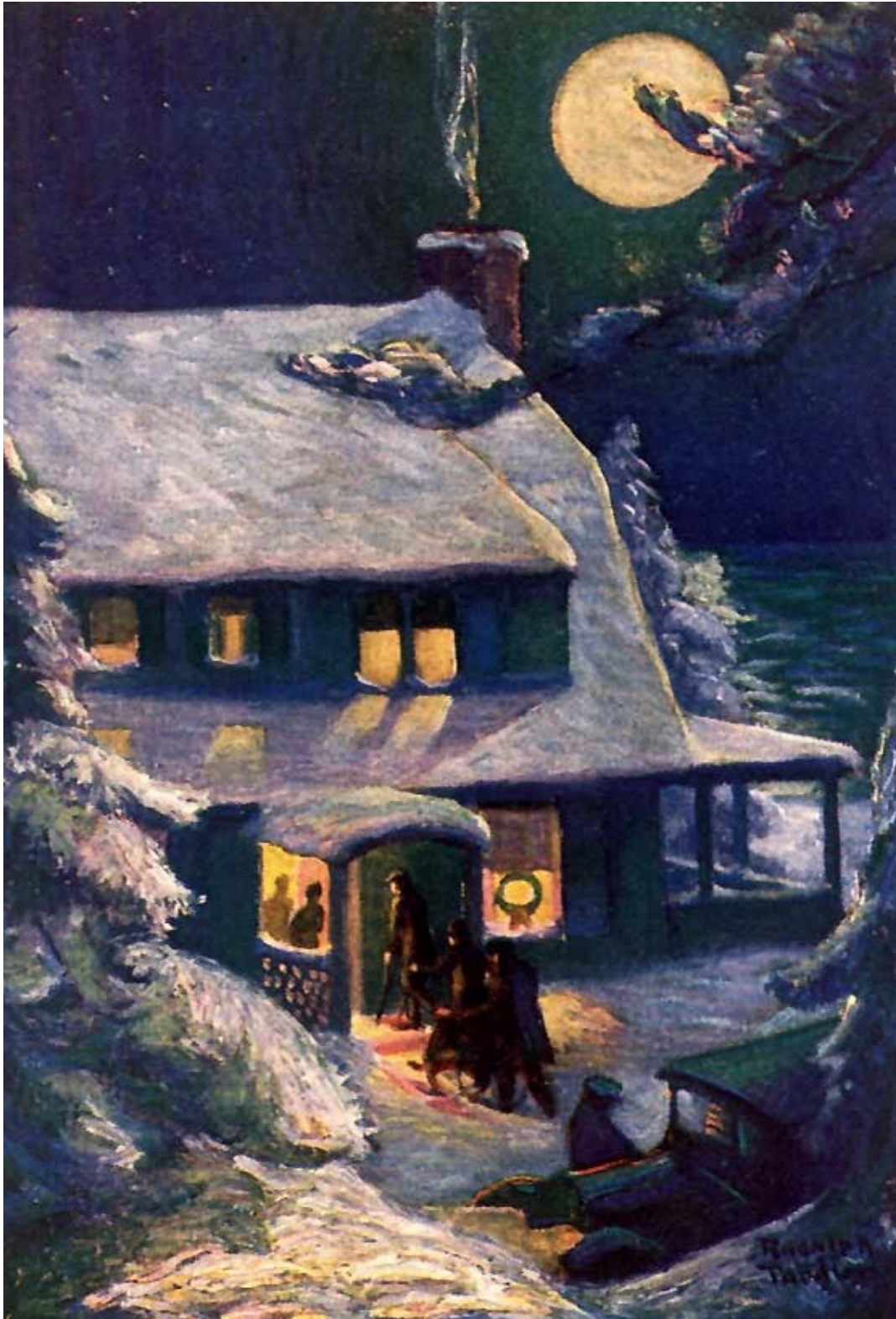
"When we rounded the last patch of scrub pines and came upon the long gray house fairly blazing with light ... the effect was stunning."