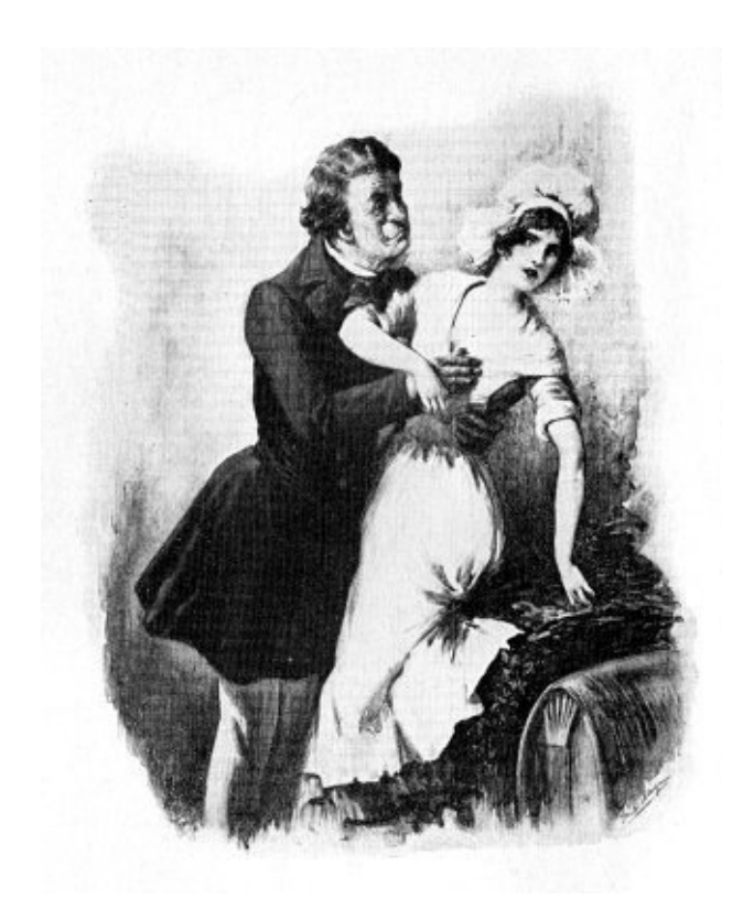
"No, my little angel! Don't be afraid!"