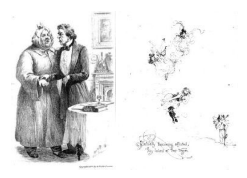
MUTUALLY BECOMING AFFLICTED, THEY LOOKED AT THEIR TONGUES

"Which of us two do you select as your doctor?"