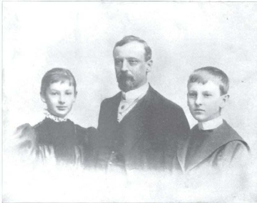
Copyright, 1898, by Little, Brown, and Company.