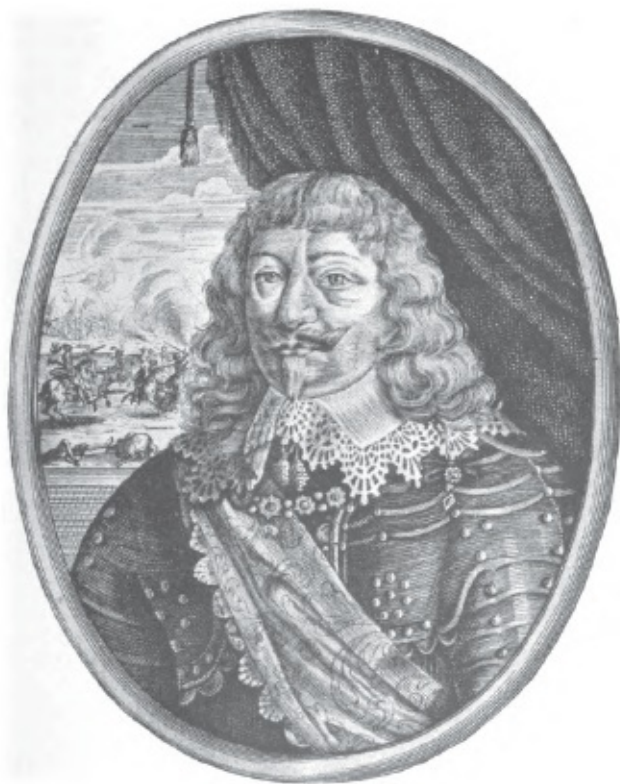
VLADISLAV IV., KING OF POLAND.