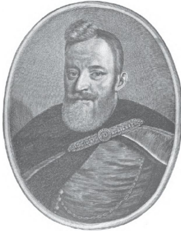
YERZY OSSOLINSKI, CHANCELLOR OF POLAND.