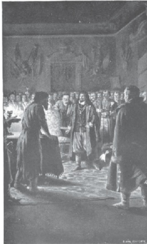
"BEFORE THEM STOOD A KIND OF FRIGHTFUL-LOOKING MAN, OR RATHER AN APPARITION."

Copyright, 1898, by Little, Brown, and Company.