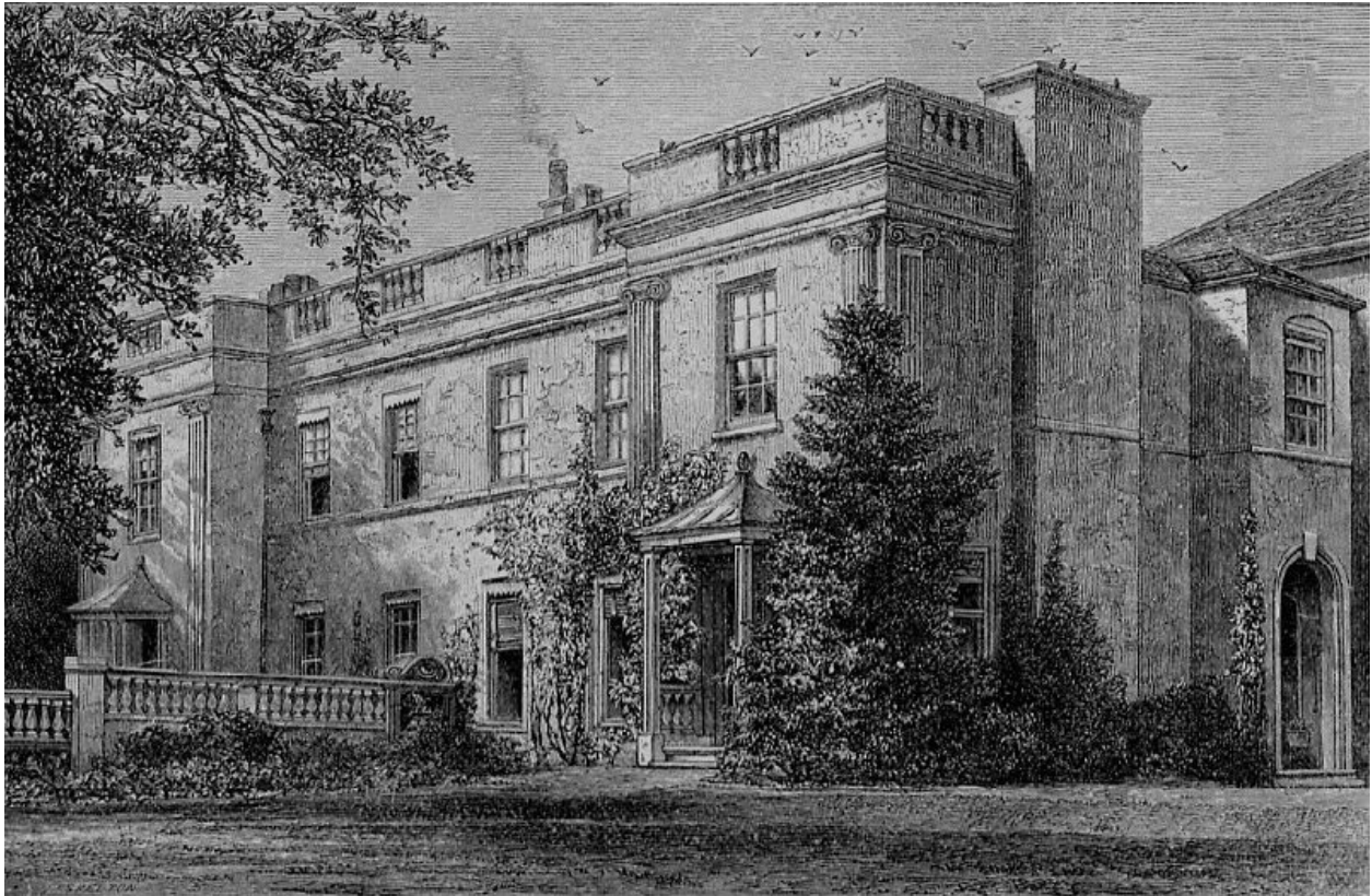
House in Foleshill Road, Coventry."

admonitions would be equally salutary and just. Truly, as the prophet of Selwyn has told us, "Heaven is formidable in its favors." Not that a wise and grateful reception of blessings obliges us to stretch our faces to the length of one of Cromwell's Barebones; nor to shun that joyous, bird-like enjoyment of things (which, though perishable as to their actual existence, will be embalmed to eternity in the precious spices of gratitude) that is distinct from levity and voluptuousness. I am really crowded with engagements just now, and I have added one to the number of my correspondents.