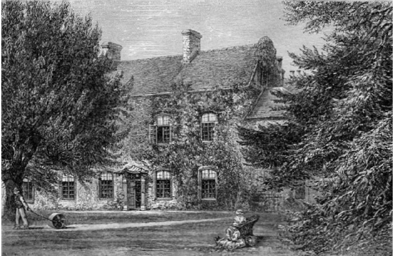
Griff House—Front View.

We can imagine the excitement of a little four-year-old girl and her seven-year-old brother waiting, on bright frosty mornings, to hear the far-off ringing beat of the horses' feet upon the hard ground, and then to see the gallant appearance of the four grays, with coachman and guard in scarlet, outside passengers muffled up in furs, and baskets of game and other packages hanging behind the boot, as his majesty's mail swung cheerily round on its way from Birmingham to Stamford. Two coaches passed the door daily—one from Birmingham at 10 o'clock in the morning, the other from Stamford at 3 o'clock in the afternoon. These were the chief connecting links between the household at Griff and the outside world. Otherwise life went on with that monotonous regularity which distinguishes the country from the town. And it is to these circumstances of her early life that a great part of the quality of George Eliot's writing is due, and that she holds the place she has attained in English literature. Her roots were down in the pre-railroad, pre-telegraphic period—the days of fine old leisure—but the fruit was formed during an era of extraordinary activity in scientific and mechanical discovery. Her genius was the outcome of these conditions. It would not have existed in the same form deprived of either influence. Her father was busy both with his own farm-work and increasing agency business. He was