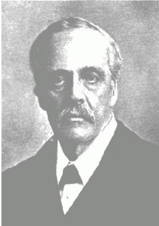
A J Balfour

In my eyes Lord Morley's crowning achievement in literature is his biography of Mr. Gladstone. How easy it would have been to smother Mr. Gladstone in stale politics!--and how stale politics may become in that intermediate stage before they pass finally into history! English political literature is full of biography of this kind. The three notable exceptions of recent years which occur to me are Mr. Churchill's Life of his father, the Disraeli biography still in progress, and the Gladstone . But it would be difficult indeed to "stale" the story of either Lord Randolph or Dizzy. A biographer would have to set about it