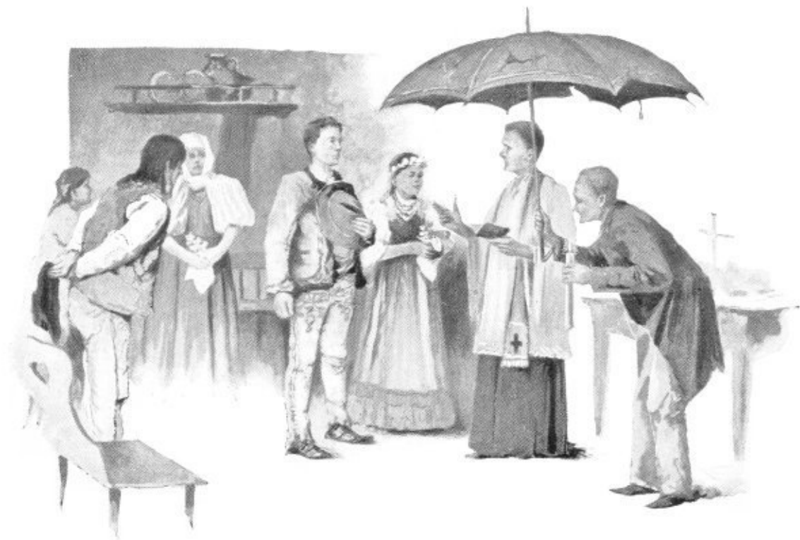
"JOINED HANDS UNDER THE SACRED UMBRELLA"